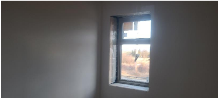
One of the new offices with a coat of primer coat