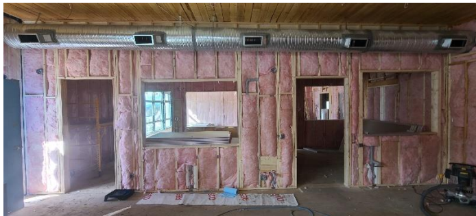
More insulation to enhance the thermal efficiency of the building, and also reduce sound transmission between rooms