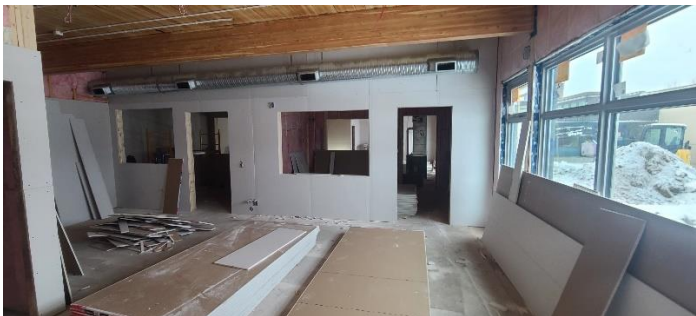
Drywall Installation Progress