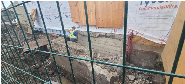
The library foundation was removed to allow for the drain tile installation and eventually new sidewalk