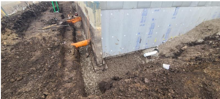
More drain tile installation on the W side of the building. Main water and electrical feeds to the building can be seen encased in concrete for protection.