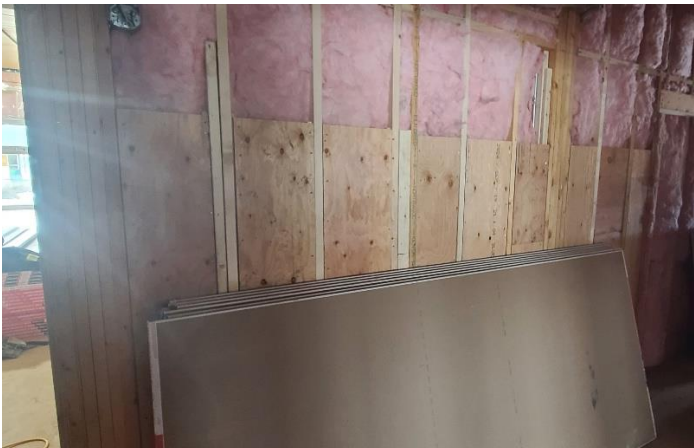
Plywood backing was installed as specified to support things like interactive walls and wall hung fixtures.