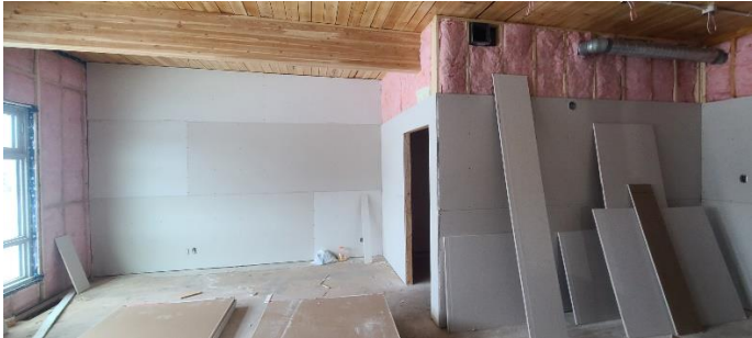
Drywall being installed over the insulation and electrical / plumbing rough ins.