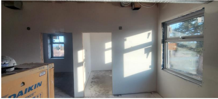
Foods Classroom with primer coat