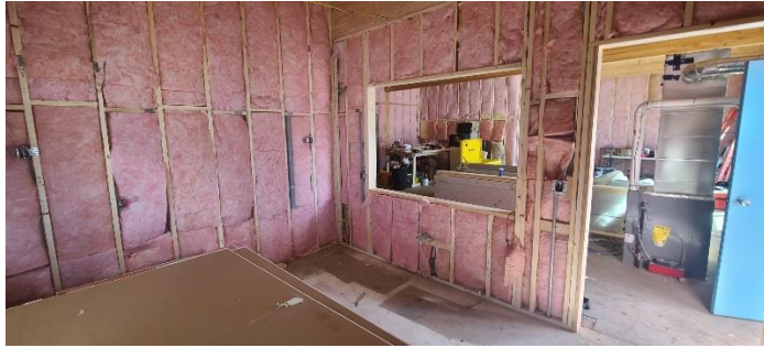
Insulation was installed on all the interior walls.