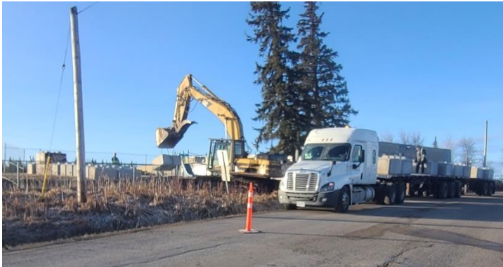
More than 80 lock blocks were delivered. LDM provided signage as we unloaded early in the mornings. The goal was that the truck was unloaded before 8am. Unloading got better each trip