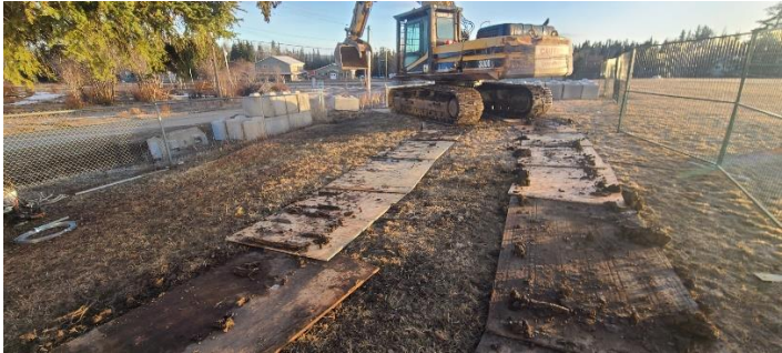
Lock Blocks for the retaining wall have been delivered to site in preparation for installation and site grading