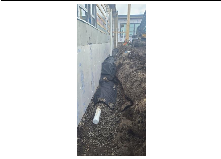
Outside the drain tile is being installed, covered in drain rock and filter cloth.