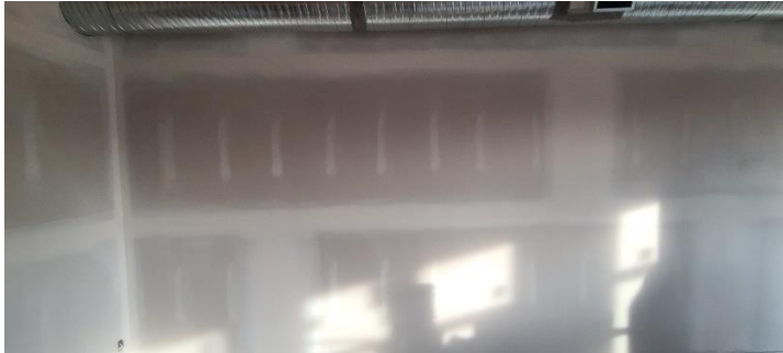
Inside, Drywall, Mud & Taping is completed