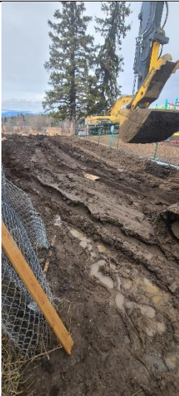
Site conditions are challenging for the crews as the spring thaw, and equipment traffic make for a VERY muddy worksite.