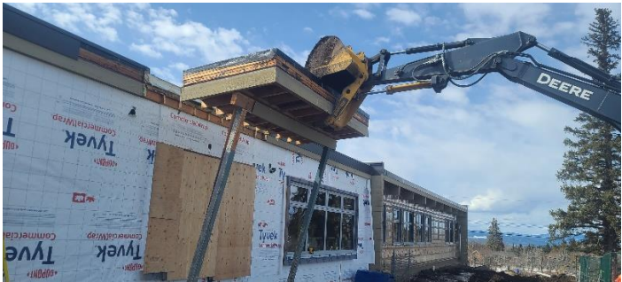
The old library entrance canopy was removed.