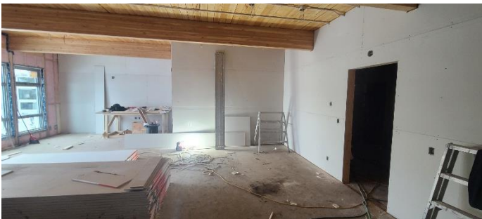
Drywall Installation Progress