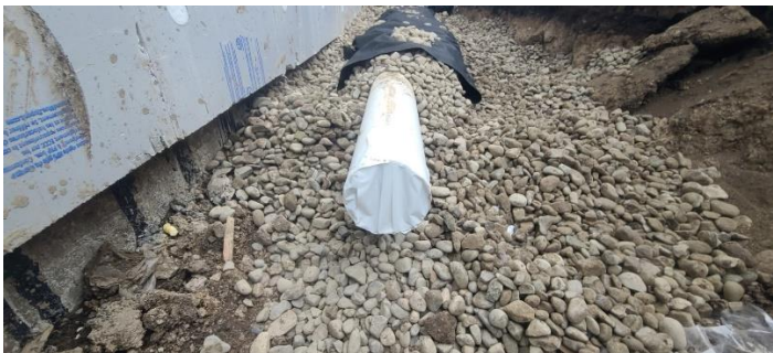
Drain tile installation. This will direct any groundwater to a drain rather than toward the foundation wall and crawl space.