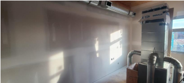
Ready for Paint!